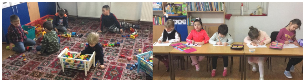
First day back at Kindergarten.