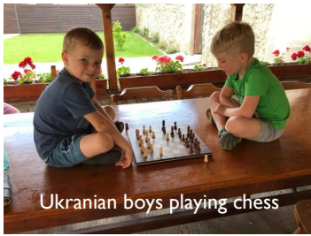
Ukrainian boys playing chess