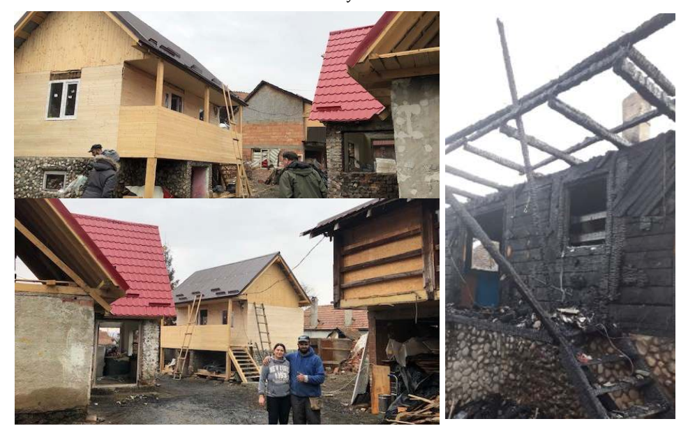
Nelu came with us to visit the 2 house building projects in the neighbouring village of Tauhan. Nelu is so familiar with all the rules and regulations, and also the best way to go about what we want to achieve. Unfortunately there are many complications for the build project for Meralina, too many to go into, but we have offered them 2 building options, and we wait to hear back from them. We have left the ball in their court.

Obviously the big news from the end of last year was the fire at Ionut & Roxana's house. Caused by a BBQ in the neighbours garden which hadn't been put out properly, their house was completely destroyed and the old peoples house lost its roof. We are so thankful to God that no-one was in the house when the fire broke out. Thank you to the massive response of you all to send funds to enable them to re-build their house. Due to unseasonable weather, and not much snow, they've been able to get on with the building. With the funds received all the building materials were purchased and Ionut provided all the labour. Ionut & Roxana are both SO grateful to everyone who gave so generously.